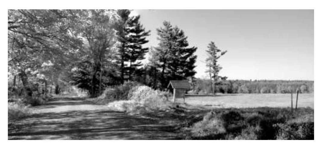
Figure 2: Surrenden Farm