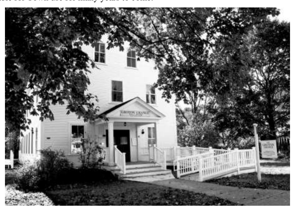
Figure 5: Groton Grange Hall

In 2009 the town approved the use of $137,000.00 in CPA funds to undertake a critically important preservation project at Groton Grange Hall, see Figure 5 . The Groton Grange Hall was originally constructed around 1890. The Groton chapter is the oldest functioning Grange in the Commonwealth, and it's building has been an integral part of Groton's town fabric for nearly a century. This project, now completed, will allow the Grange to continue to make its facilities available for Town use for many years to come.