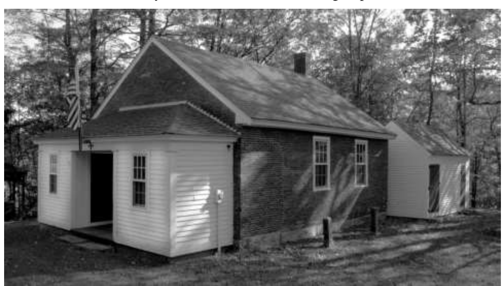
Figure 3: Sawtell School House

In 2006 the Town voted to approve the use of $18,500.00 in CPA funds for preservation of the Chicopee School #7 (aka Sawtell School). See Figure 3. This school is listed on the National Register of Historic Places and is one of the last remaining original school houses in Groton. With private donations and volunteer labor, the Sawtell School Association used the CPA funds to successfully complete desperately needed preservation work on the school house As a result, this school house can now safely accommodate tours of area groups and visitors.