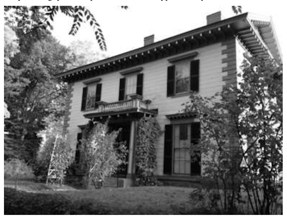
Figure 6: Boutwell House

In 2010, Boutwell house suffered two very serious water pipe failures which flooded portions of the museum's exhibition and work areas. The Board of Directors brought in several new members, wrote a long-range plan and applied for grants. These resulted in both a Community Preservation Act grant for $176,525 which was unanimously approved at Groton Town Meeting in April 2013, and a Cultural Facilities Fund grant for $79,000 awarded in November 2012 from the Massachusetts Cultural Council. Both of these grants were for physical renovations such as new wiring and plumbing, plaster replacement, a fire suppression system, and a new furnace.